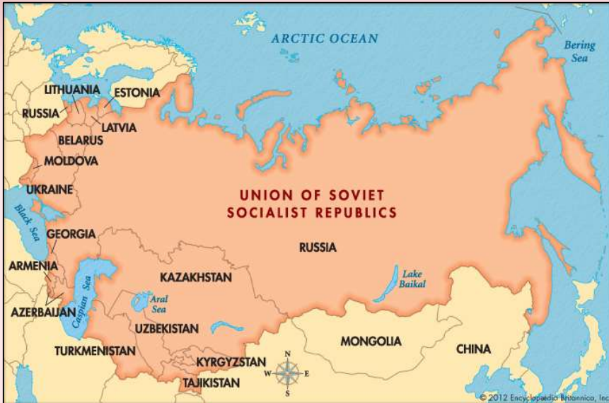
Soviet Union before the Break-up

15 Independent Republics after the Break-up