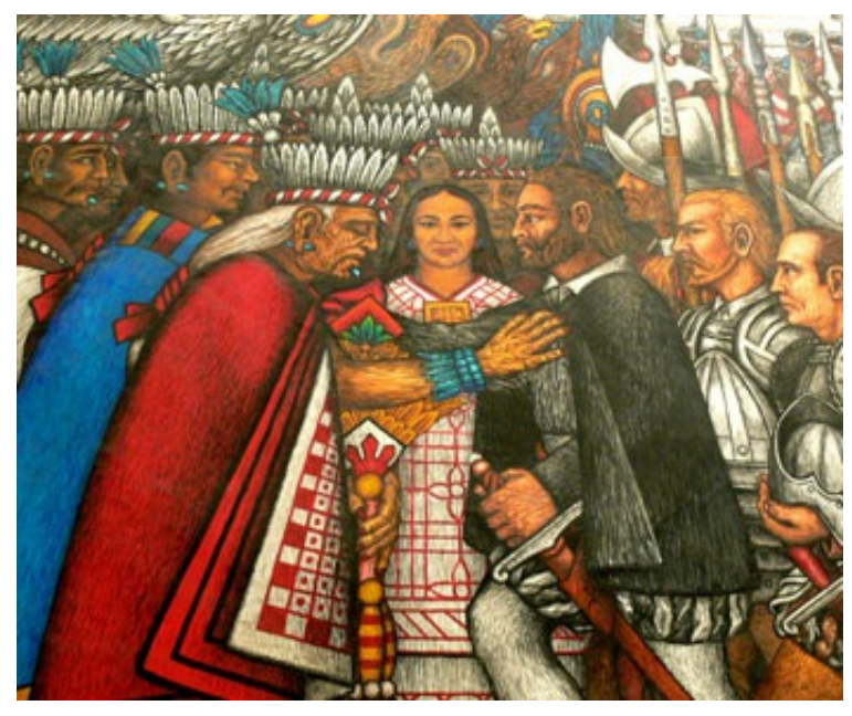
A depiction of Cortés and Montezuma's meeting, with Malinche in the middle